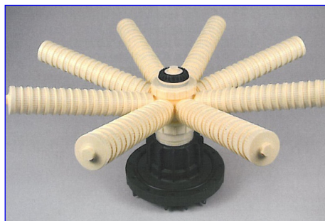
P/N: 500001-X Polypropylene Hub and Lateral 8 threaded lateral with 0.008" slot