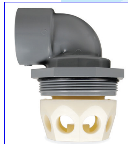
P/N: 100346 Single Point PVC Upper Distributor