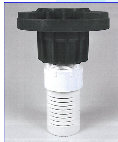
P/N: 100343-5 Single Point Sch 40 PVC Upper Slotted Distributor